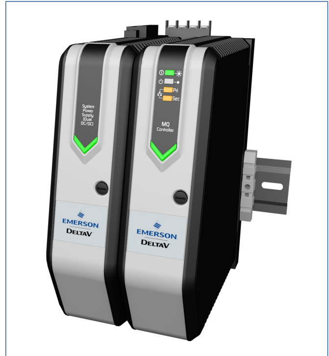
The MQ Controller.

Mounting. This plug-and-play system structure provides modular system growth with a single controller and can be mounted in a Class 1, Div 2 or ATEX Zone 2 environment. Refer to the System Power Supplies and I/O Subsystem Carriers product data sheets for additional information.